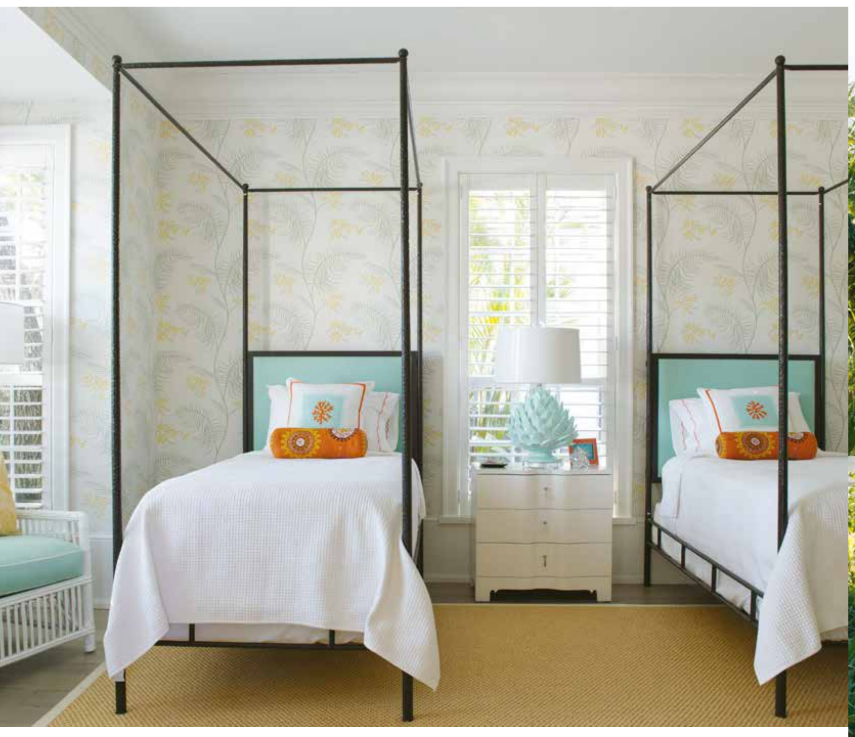
This room does double duty as sleeping quarters for the Connor daughter or as a guest room. The hand-hammered iron canopied beds contrast with the soft mimosa white wallpaper. Recycled materials comprise the papier-mâché artichoke lamp.

television sets that were visible and accessible in every room. So I didn't try to hide the TVs. I just let 'em hang out."