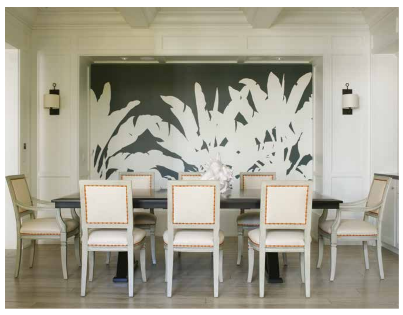
For intimate dining, the architects lowered the ceiling. The niche, decorated with colored wallpaper, is Patti Connor's favorite spot in the house.

house, dating back to the 1970s, was dark and cramped. To make the house livable, the Connors knew they were in for major renovations.