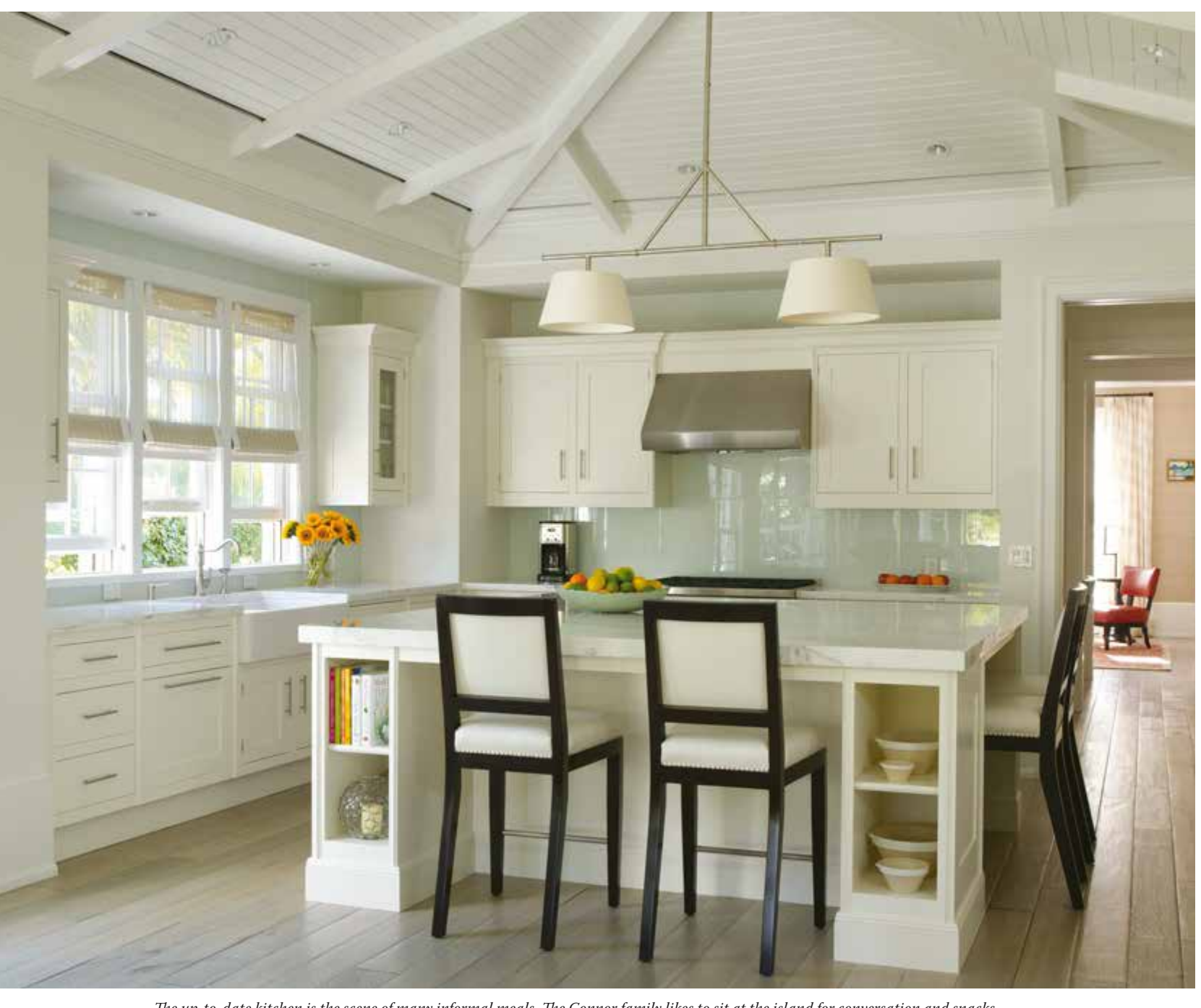
The up-to-date kitchen is the scene of many informal meals. The Connor family likes to sit at the island for conversation and snacks.

transoms in a series of windows. From dark interior spaces, he constructed corridors that terminated in windows or doors that emitted bright patches of light.