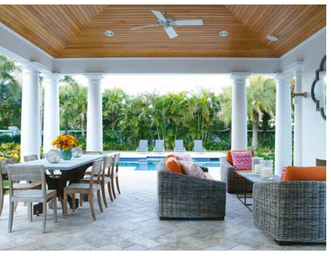
The loggia is the go-to spot for the Connors. This outdoor room, a handy transition from the main house and the rear yard, is situated close to the kitchen for easy al fresco dining.

concrete to the finished product. We agonized over a number of plan iterations before we finally felt we had it right. In the end it all came together. Now we can just sit back and enjoy the house."