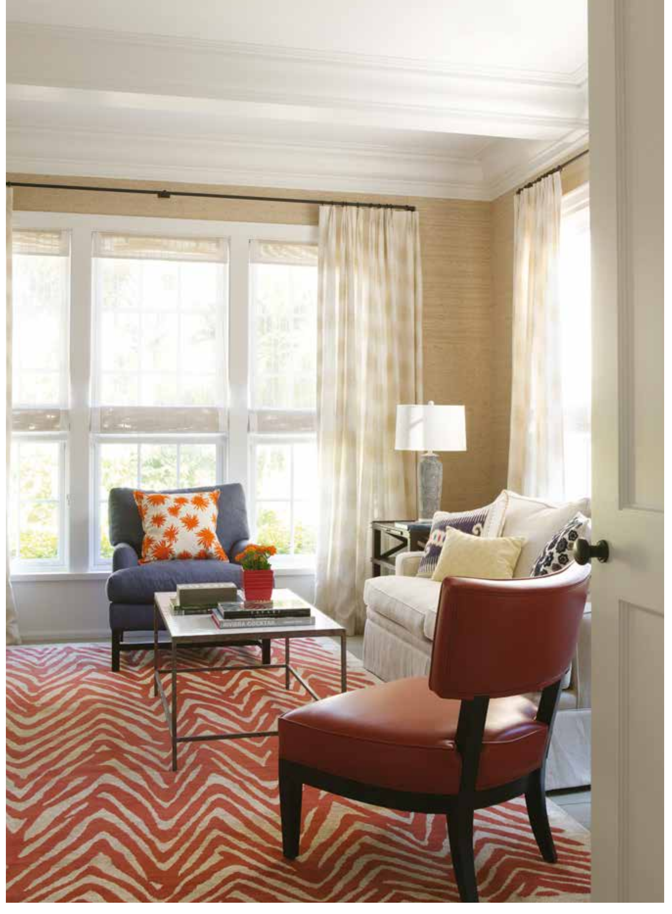
A \ hand-knotted \ Tibetan \ rug \ adds \ pizzazz \ to \ the \ study. \ The \ room \ can \ be \ closed \ off from \ the \ rest \ of \ the \ house for \ serious \ work; but \ with \ its \ convertible \ couch \ and \ adjacent \ full \ bath, \ it \ can \ also \ accommodate \ house \ guests.